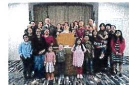
Naschitti Baptist Church