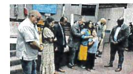
Missions Conference in Hemet, CA