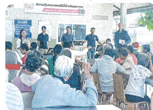
Center for Displaced Persons

James 1:27 - "Pure religion and undefiled before God and the Father is this, To visit the fatherless and widows in their affliction, and to keep himself unspotted from the world."