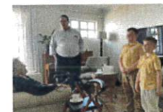
Nursing Home Ministry