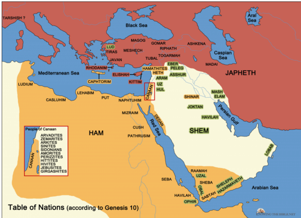
Map of the Origin of Nations and Races that were dispersed by God in Genesis 10

The big question of how all the nations and races began and what was the origin of all civilization can be answered in Genesis chapter 10. The Bible reveals that every race upon the earth originated with the three sons of Noah; Shem, Ham, and Japheth.