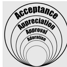
“Proud of Me”