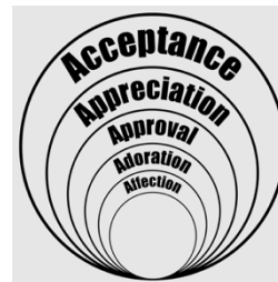
“Passionately Pursuing Me!”