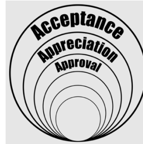
“Pleased with Me!”