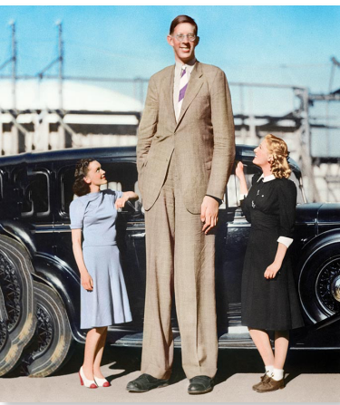
Robert Wadlow 1940 8'11" tall