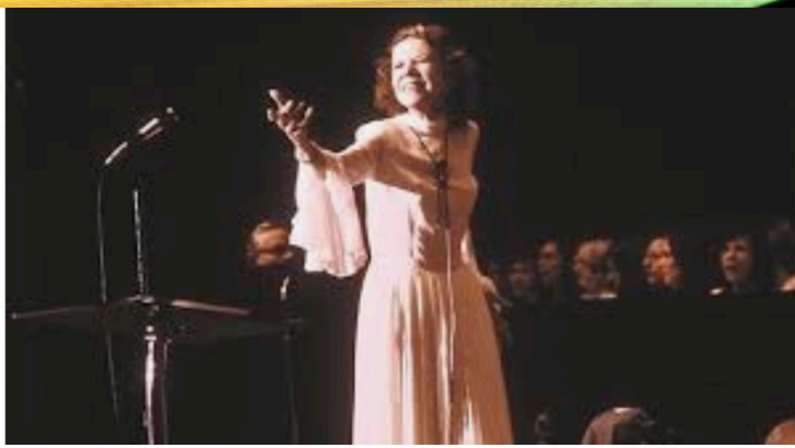
Kathryn Kuhlman: Turning Points in... eerdword.com