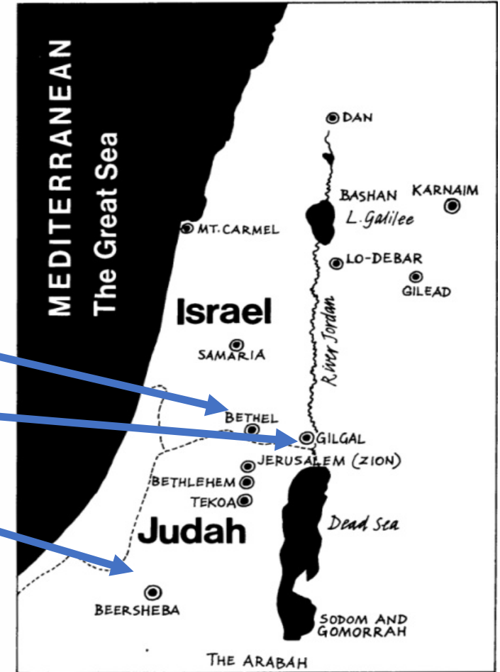
The places in Israel and Judah mentioned in the book of Amos.