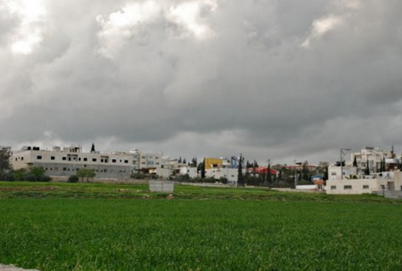
Fields of Boaz – East valley South valley