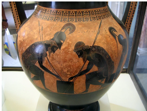
Achilles and Ajax on an urn