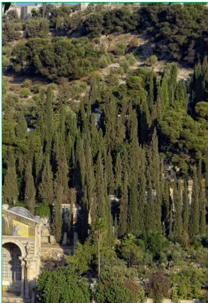
Mount of Olives in Modern Times.