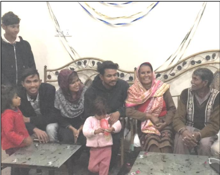
The family. The daughter is on the left of center.