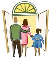
WELCOME to Our Church

The CDC's most recent COVID Community Levels for Mercer County remain Low. Witherspoon's COVID protocols for in-church worship service going forward are that masks are optional for in church worship for low risk parishioners and are highly recommended for people at high risk for severe illness in consultation with their health care providers. Hand sanitizing before entering the sanctuary and social distancing within each pew such as sitting on the ends or in the middle of a pew are in effect. Self health screening at home is encouraged prior to worship. If you are not well, please stay at home and contact your healthcare provider. Witherspoon will continue to monitor our COVID Community Levels weekly and update our protocols when the levels change.