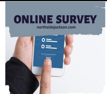
Church wide survey available on our app & website.

Northside Church Merchandise Order at Welcome Desks. Purchases also available online. Your order will be pulled based upon first come availability, and will be ready for you to pay and pick up the following week at welcome center or in the church office on Wednesdays from 11 am-1 pm.