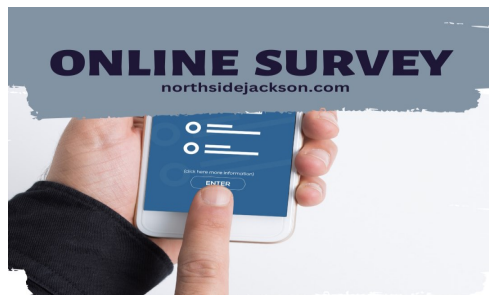
Church wide survey available Tuesday, March 7

During this time, if you feel God revealing something to you or an idea or thought or even a word of encouragement– whatever you would like to share, an email address has been set up as an avenue for your thoughts to be heard. You may send your email to elders@northsidejackson.com and that will be forwarded to each person on our Board of Lay Elders. We want to hear from you!