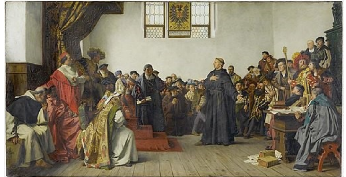
Luther Before the Diet of Worms by Anton von Werner (1843-1915)

Image courtesy of The Staatsgalerie Stuttgart.