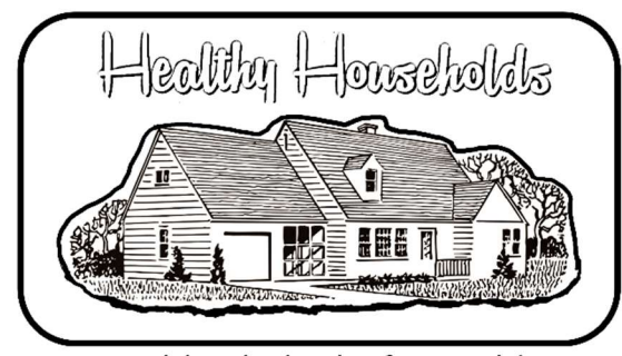
Ten Biblical Planks for Building an UN shakable Household

THE PLANK THAT KEEPS US FROM BEING PUT-OFF BY ALL THE PLANKS OR PUTTING-OFF DOING ANYTHING BECAUSE WE CANNOT DO IT ALL PERFECTLY.