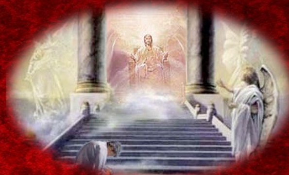
The King Enthroned on Earth