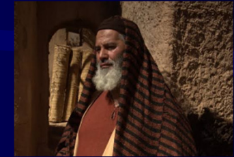
Nicodemus (John 3:1, 7:50)