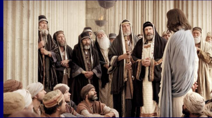
Inquisitive & Seeking?