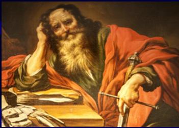
Paul (Acts 23:9, 26:5, Phil 3:5)