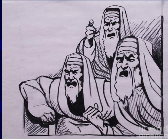
Angry & Confrontational?