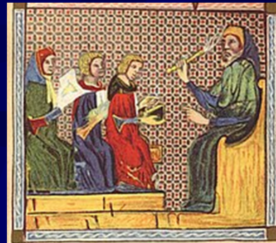
Gamaliel (Acts 5:34)