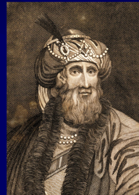
Flavius Josephus the Historian

History of the Jewish War The Antiquities of the Jews Against Apion