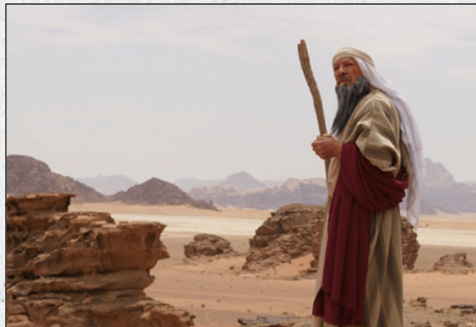
Moses in the wilderness