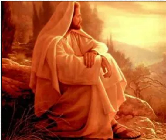
Jesus on a mountain