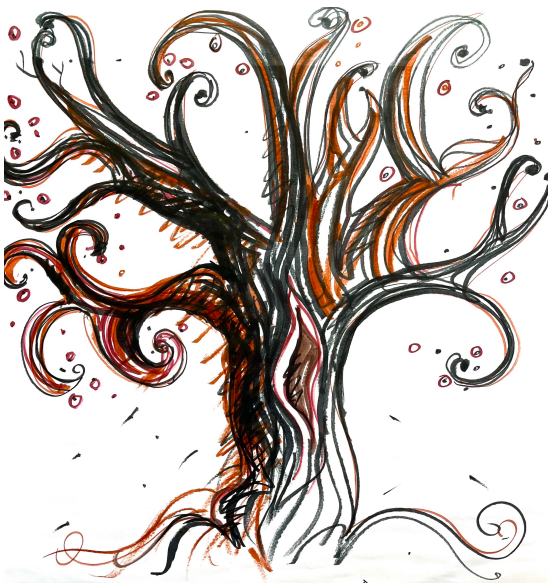
Hearts without Christ are dead because of sin.