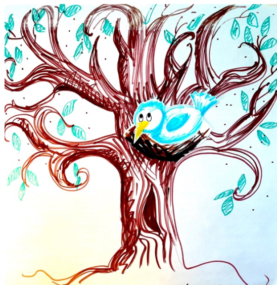
The Holy Spirit brings life to our dead hearts.