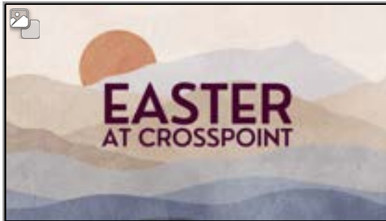
1 Group Surprised by the Hope of...