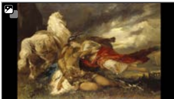
5 Group Surprised by the Hope of...