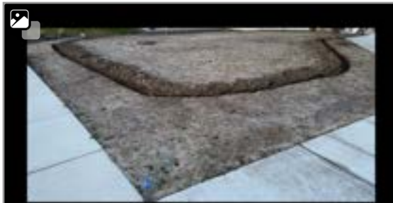
3 Group Surprised by the Hope of...