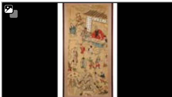
6 Group Surprised by the Hope of...