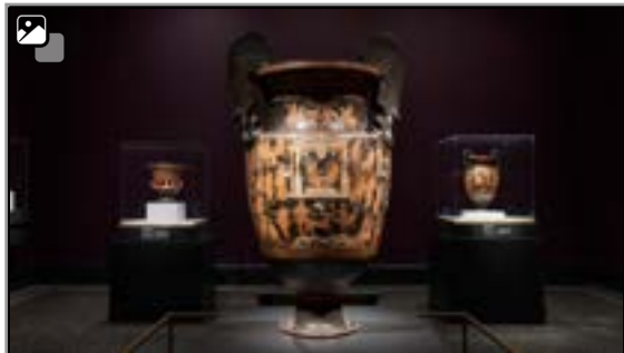
4 Group Surprised by the Hope of...