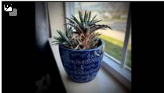
2 Group Surprised by the Hope of...