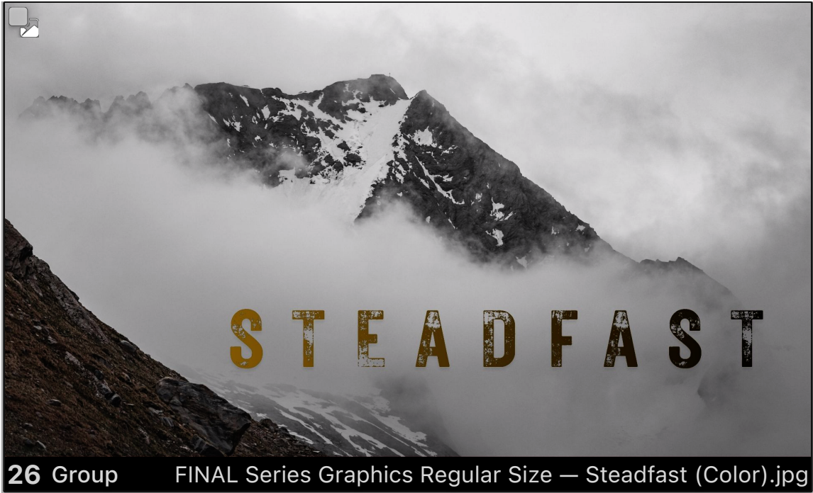
26 Group FINAL Series Graphics Regular Size — Steadfast (Color).jpg