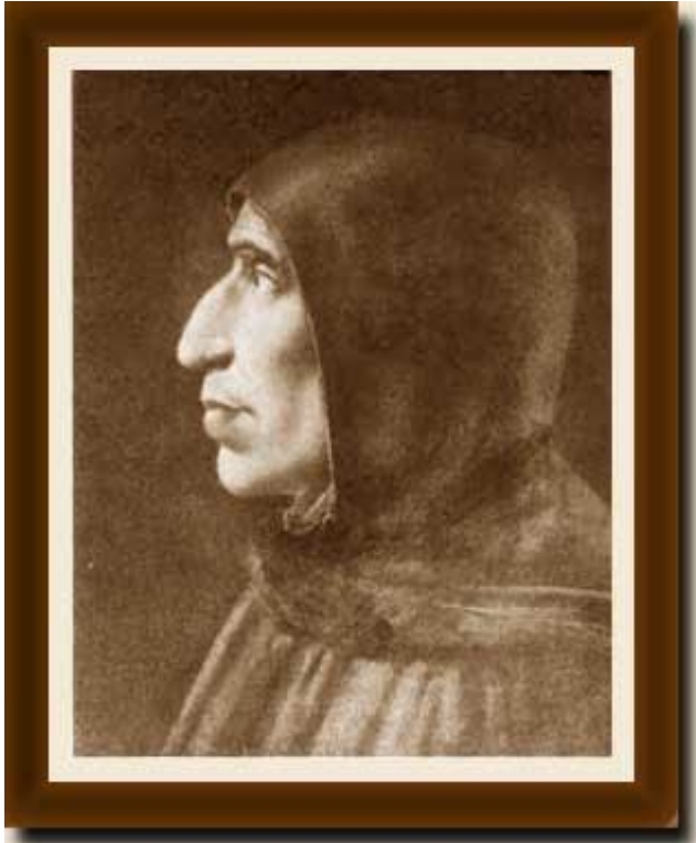
Jerome Savonarola (September 21, 1452 – May 23, 1498) Patron of Savonarola Theological Seminary