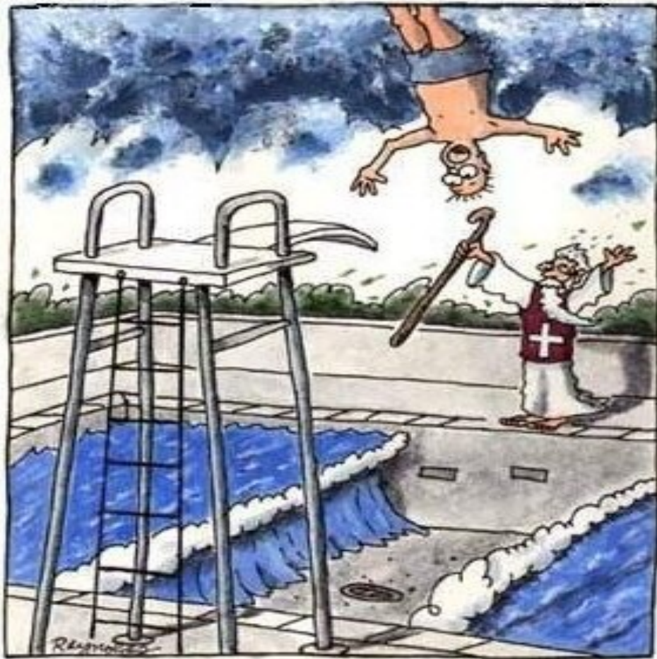
Moses' first and last day as a lifeguard.