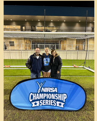
"I thought you would never see me play again."

Yet it was good of you to share in my troubles.