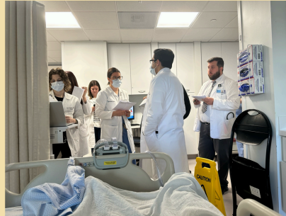
Liver Failure Letting people help me Existential anxiety My prayer