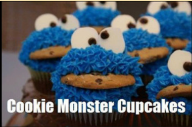
Cookie Monster Cupcakes