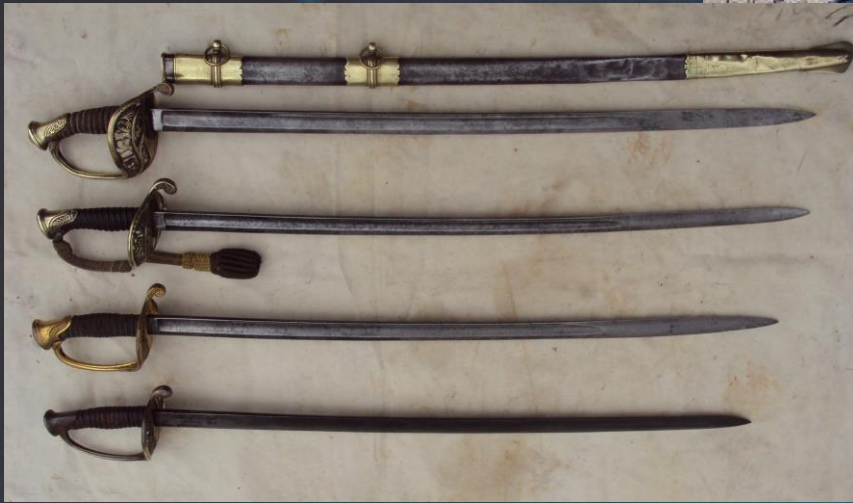
Swords and Bayonets