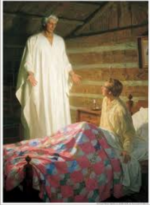
Angel Moroni 1823