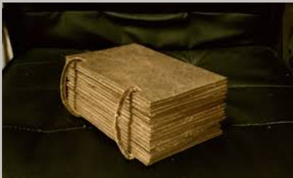
Golden Plates in New York