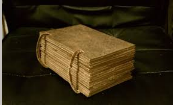
Golden Plates in New York