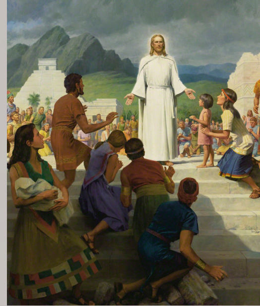
Jesus In America with Indians

“the fullness of the everlasting Gospel as delivered by the Savior.”