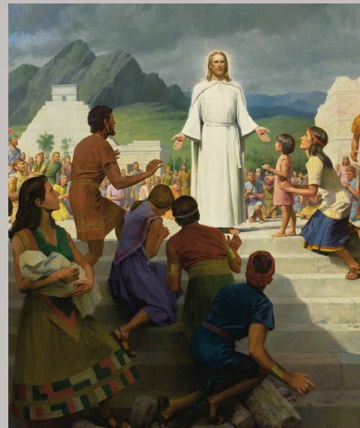
Jesus In America with Indians