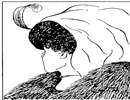
What do you see? By shifting perspective you might see an old woman or a young woman.

c. Do you see an old woman or a young woman?