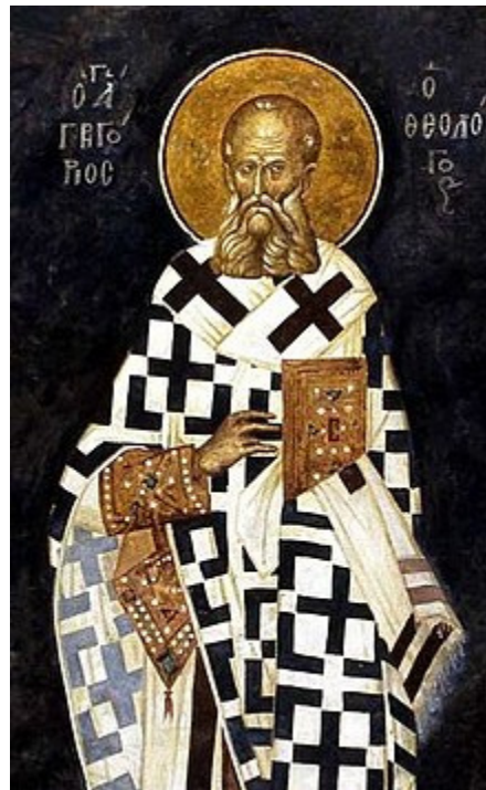
Icon of St. Gregory the Theologian, fresco from Kariye Camii in Istanbul, Turkey

Theologian, Doctor of the Church, Great Hierarch, Cappadocian Father, Ecumenical Teacher