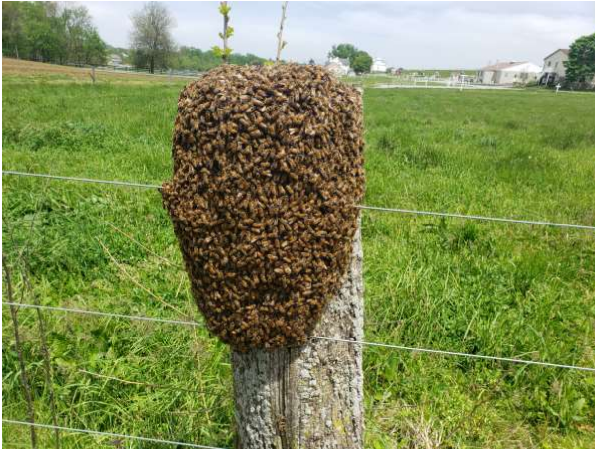
Swarm on a fencepost