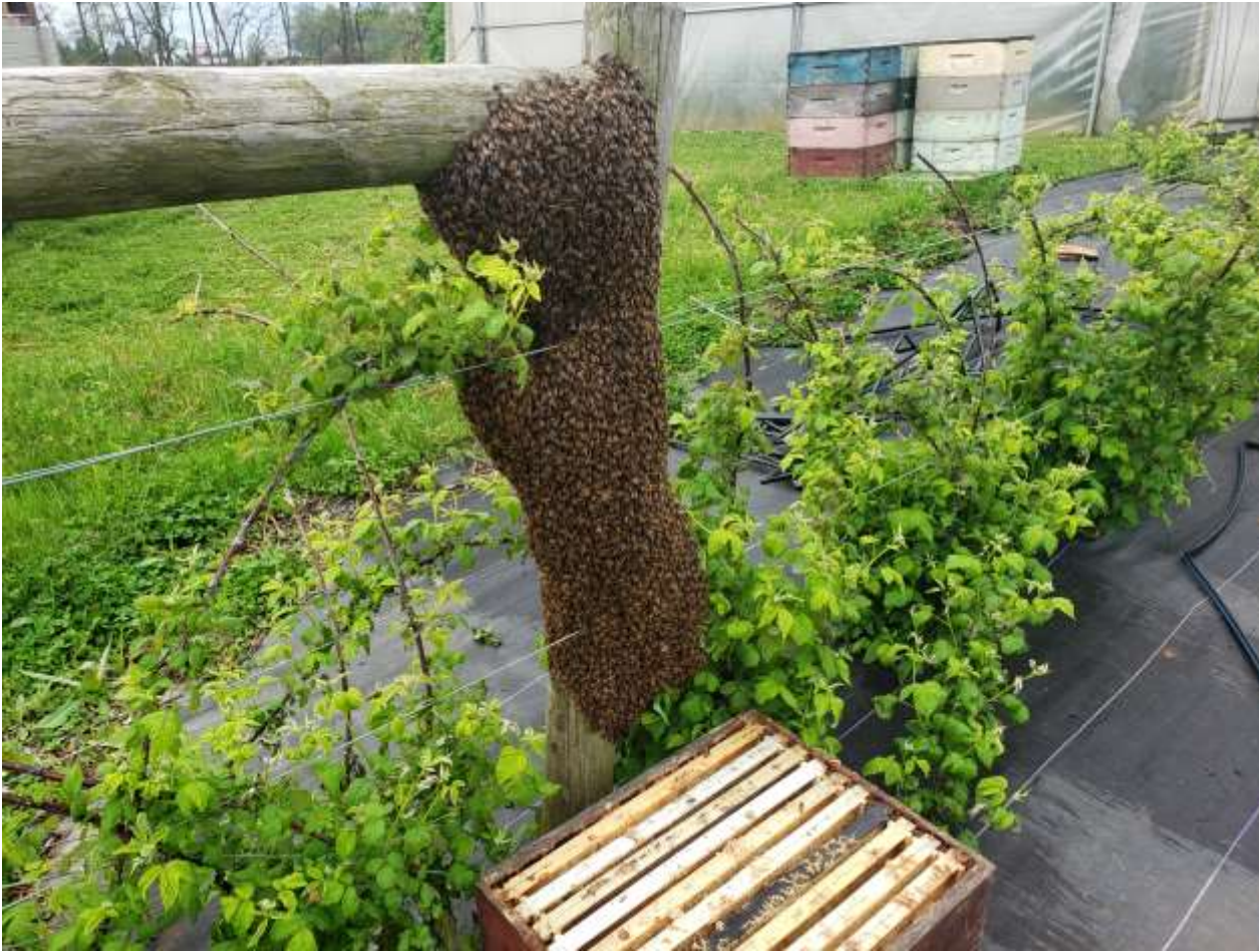
Swarm on a fencepost