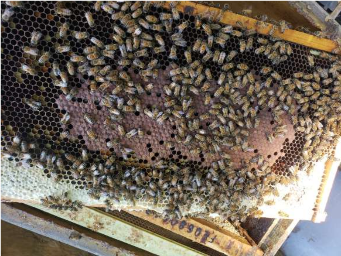
One frame pulled out showing brood