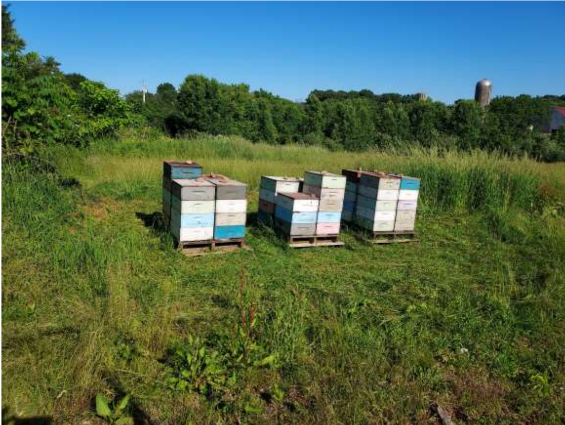
Twelve hives of bees