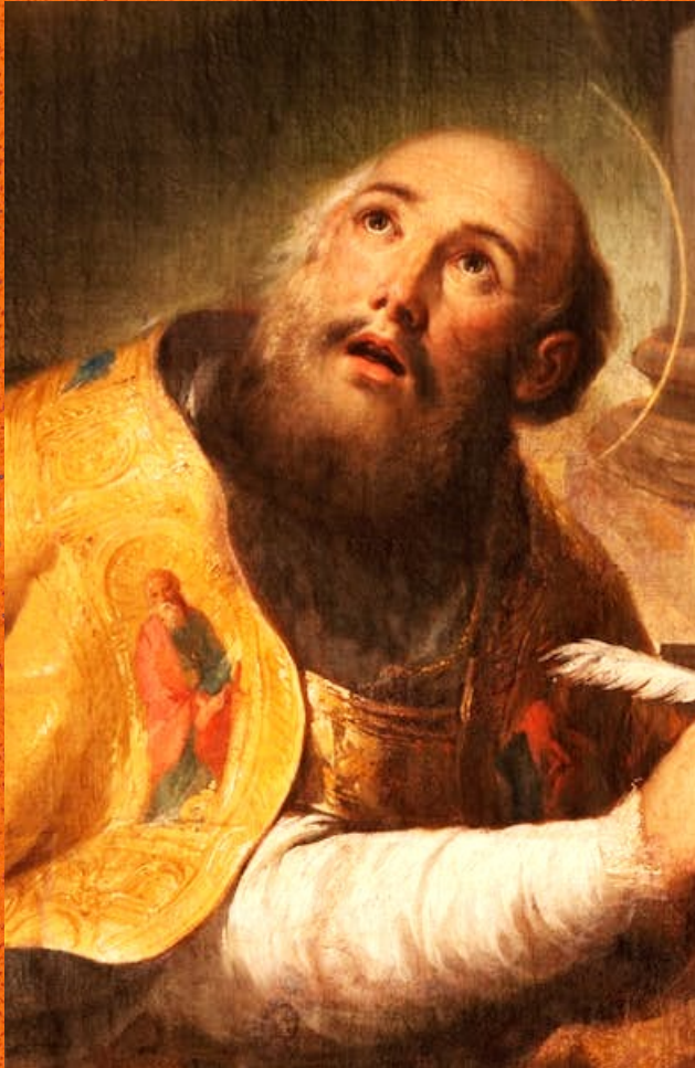
Augustine, c. 300 AD