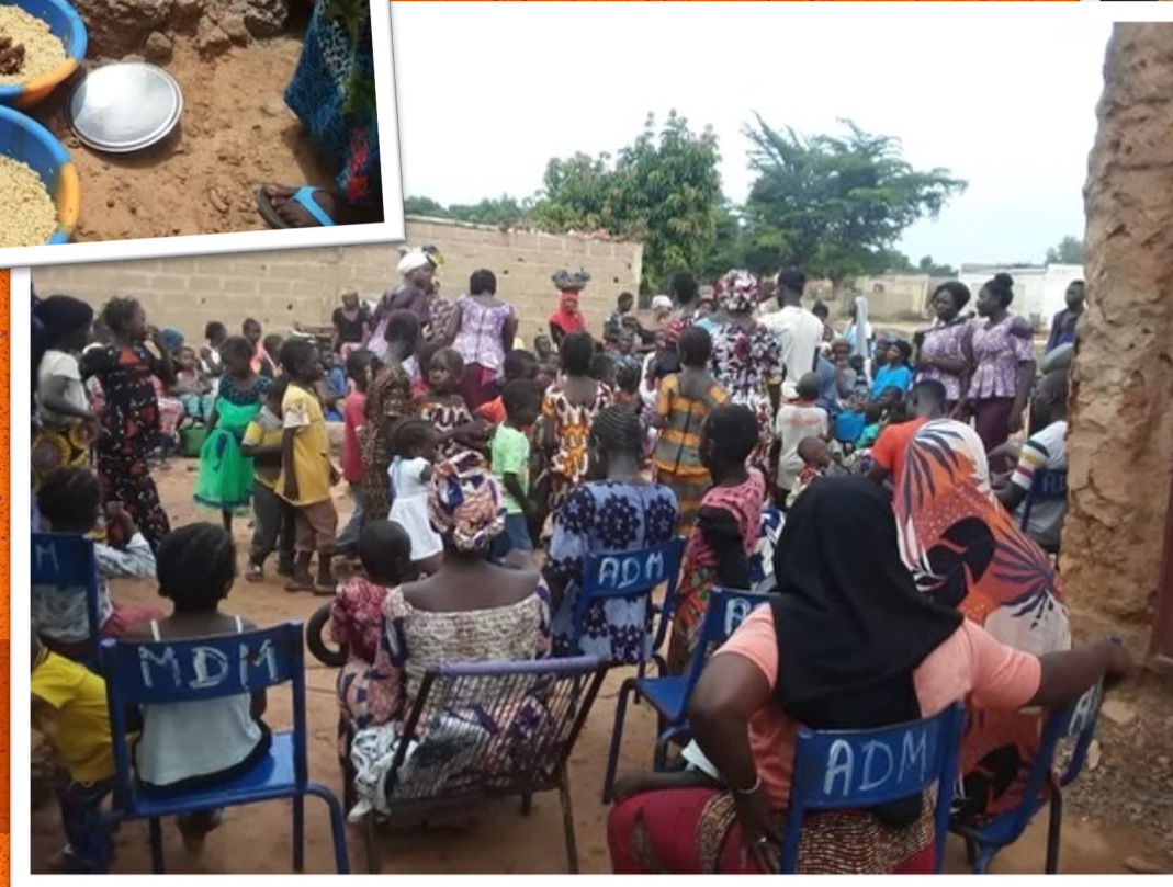
Bambara People Group, Mali, AFRICA