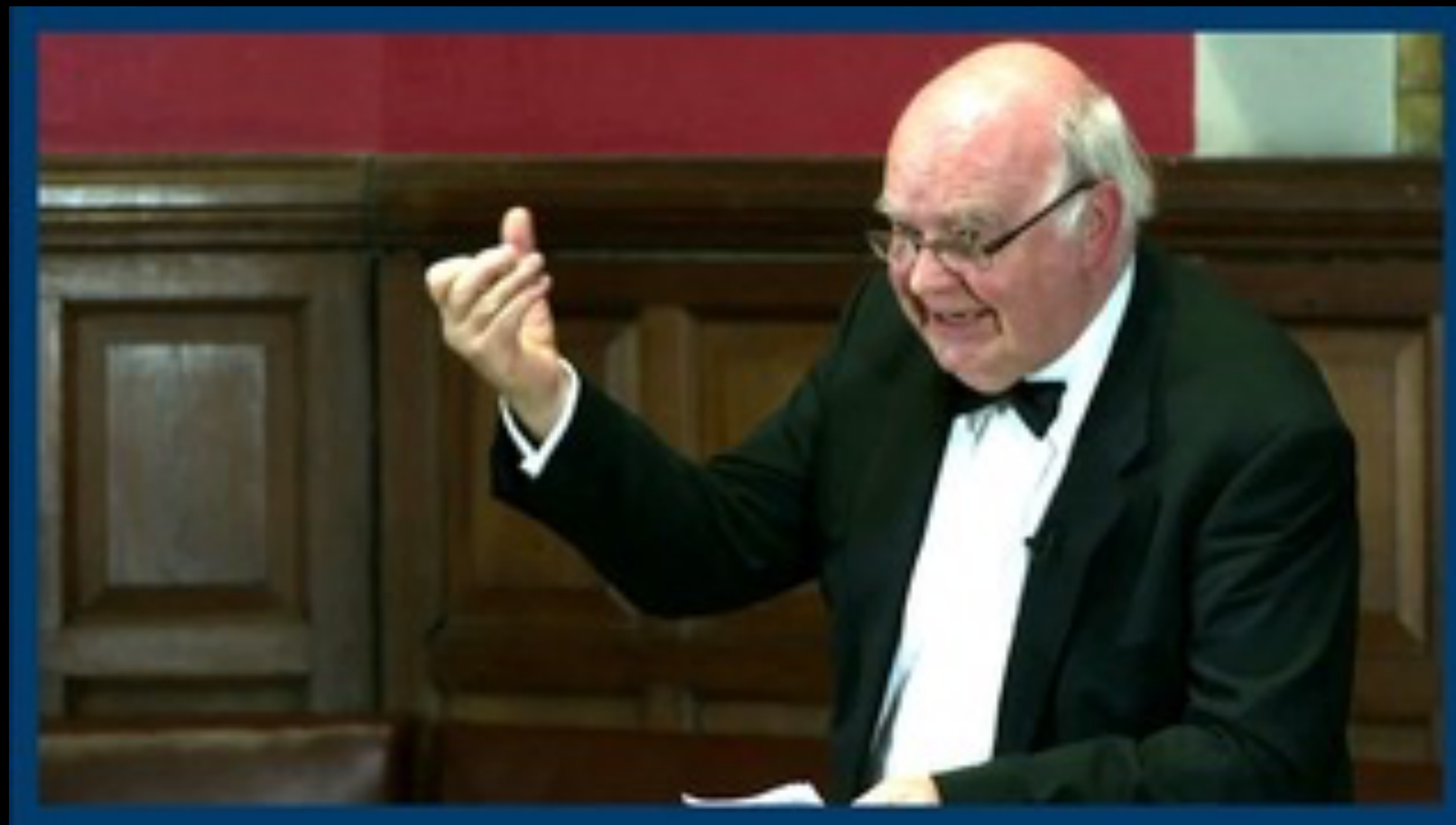
John Lennox at Oxford