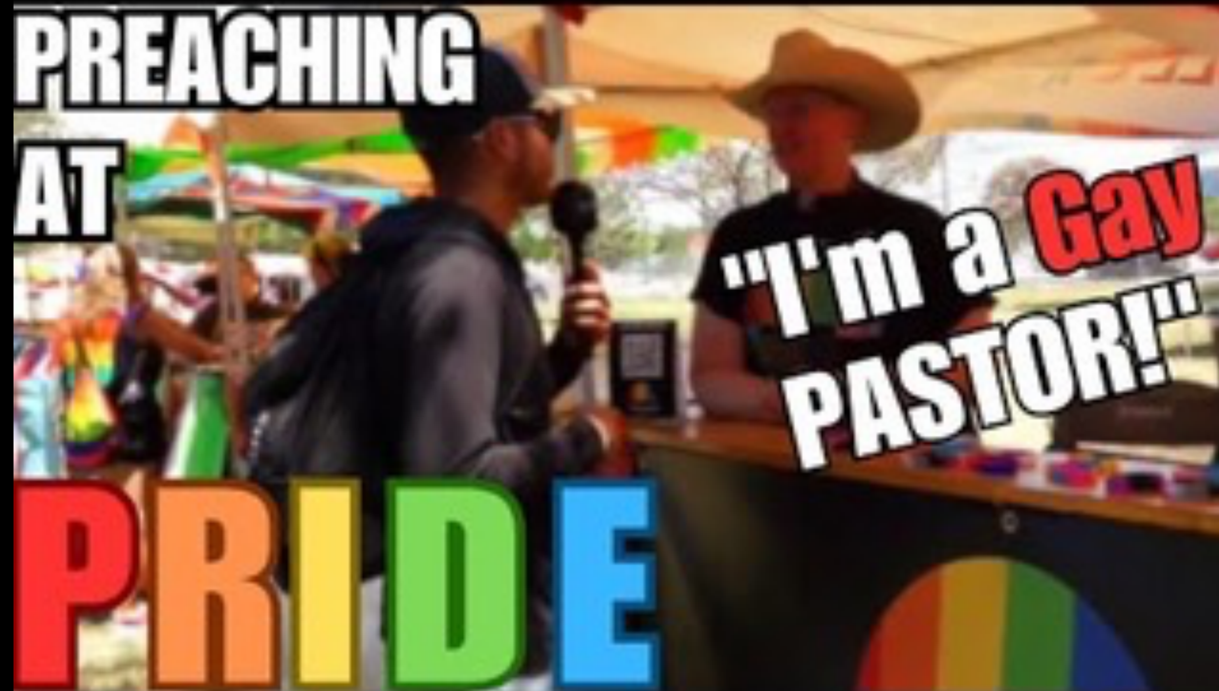
Street preacher at the gay pride event