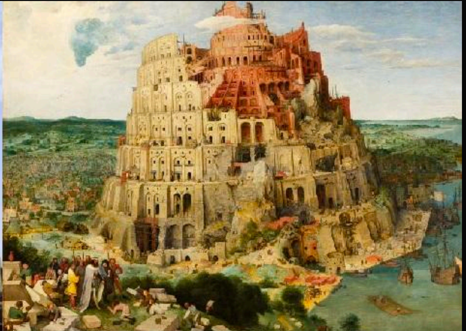
Tower of Babel, by Breugel (c. 1563)