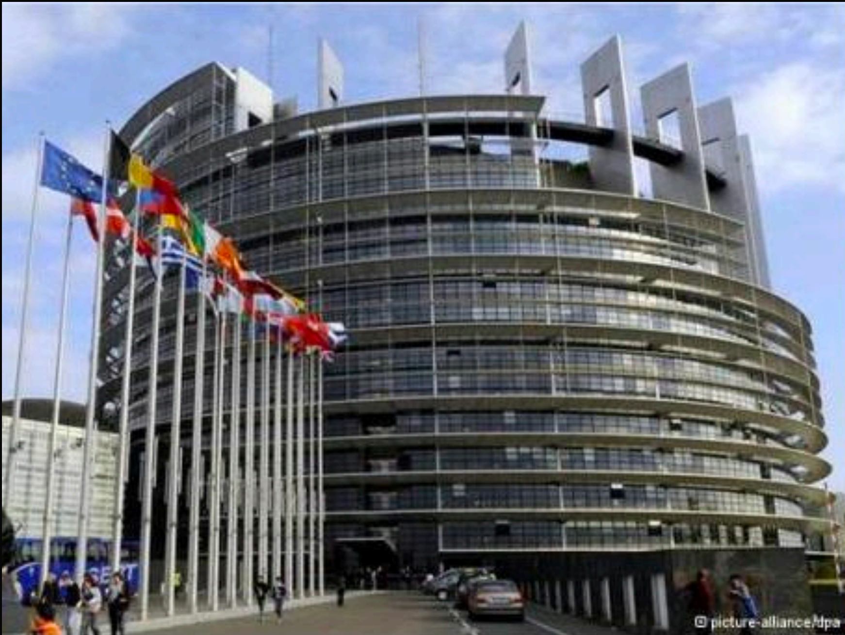
European Parliament, Strasbourg, France