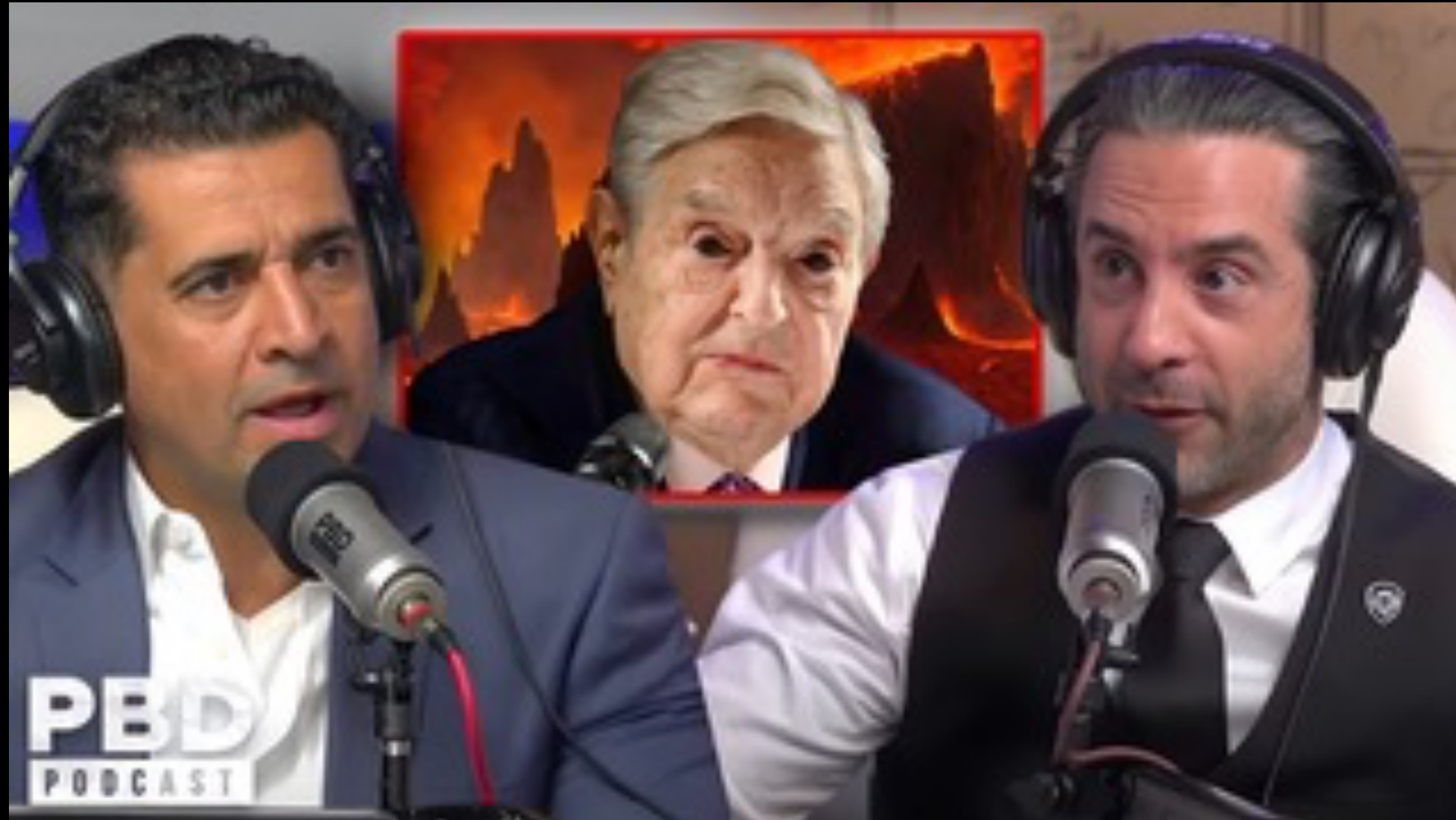
PBD – podcast George Soros