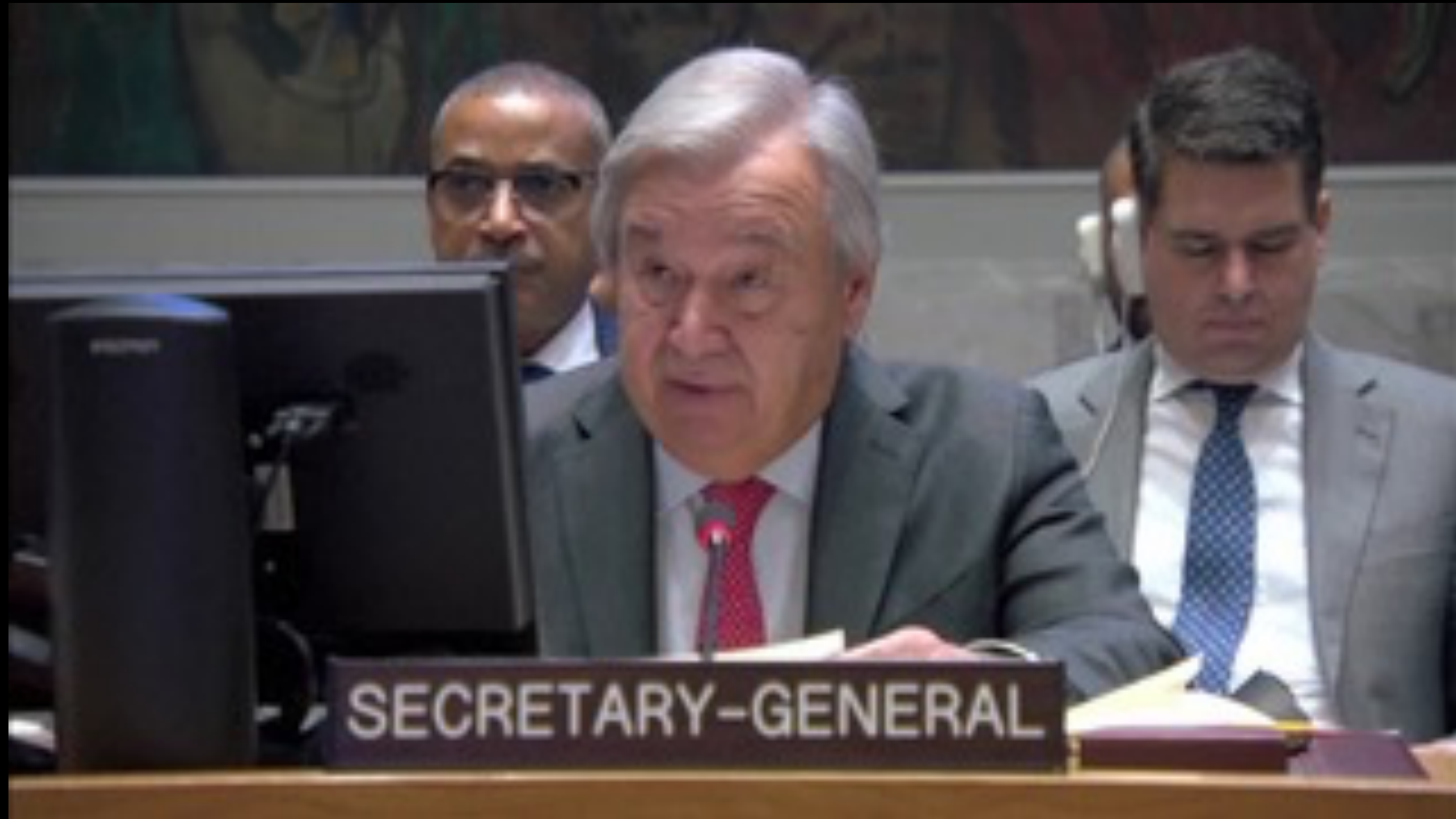
Secretary General United Nations