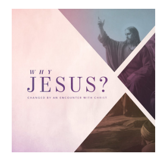
Why Jesus? - Zacchaeus