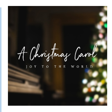
Repeat the Sounding Joy