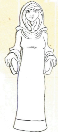
The Other Half Finish the picture by drawing in the other half. Whom did the angel say was going to be the mother of God's Son? Mary