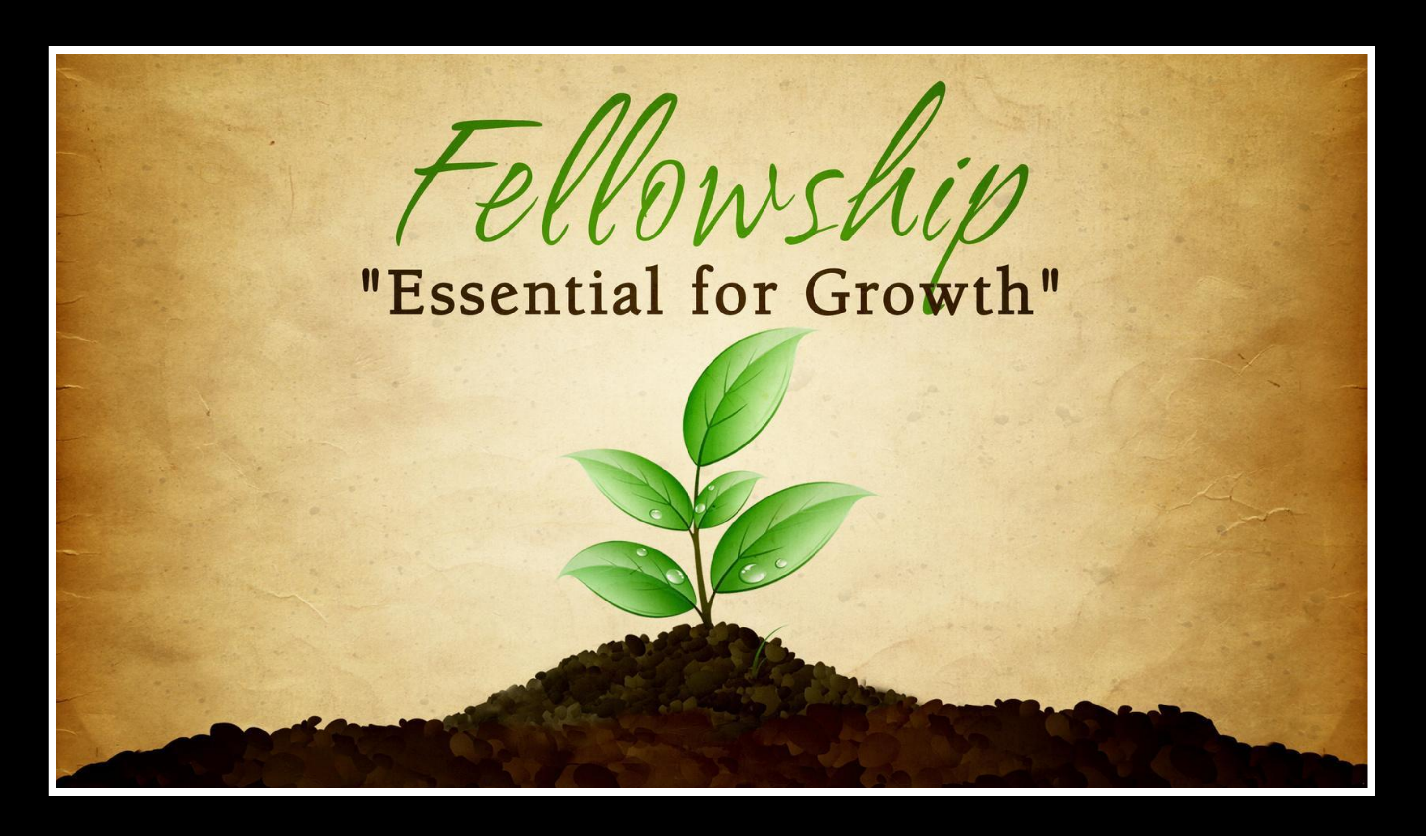
Please stay for Refreshments!