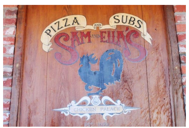
Sam and Ella's Restaurant (Salmonella)