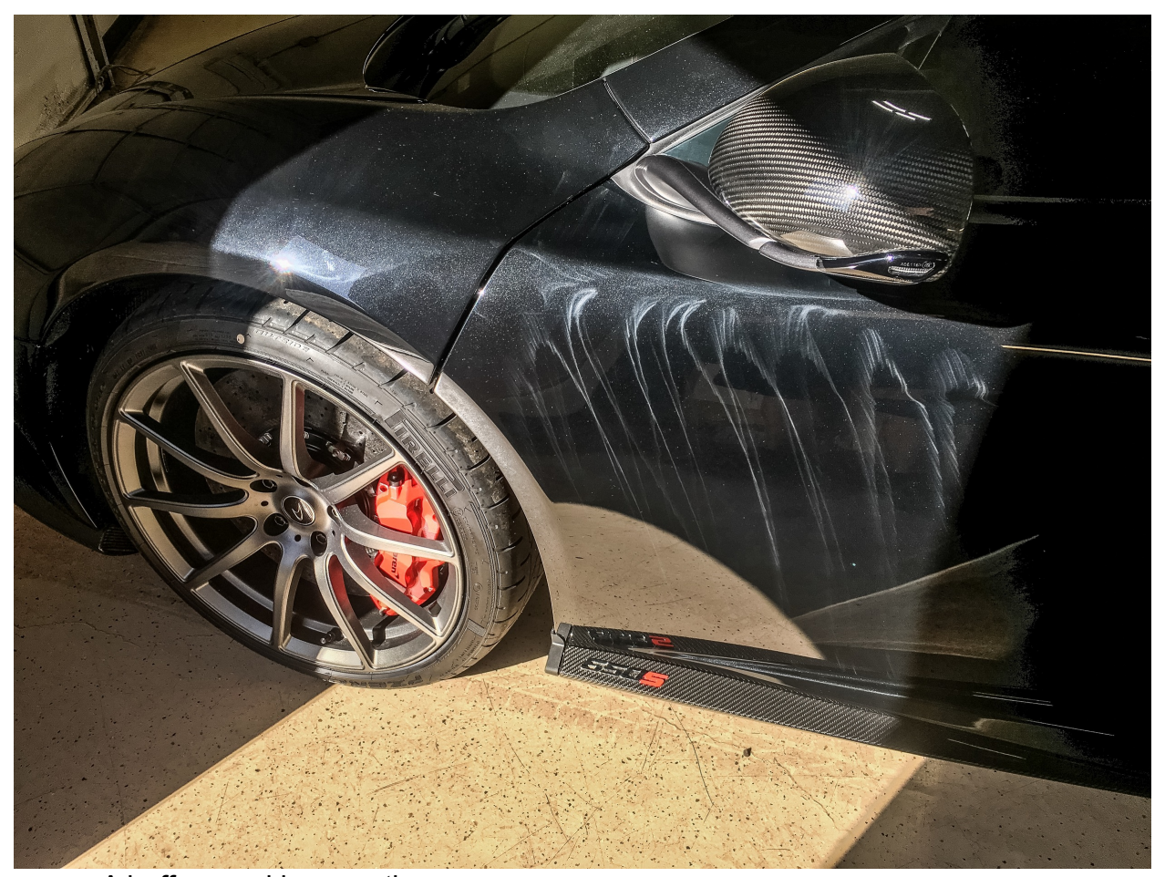
A buffer used incorrectly