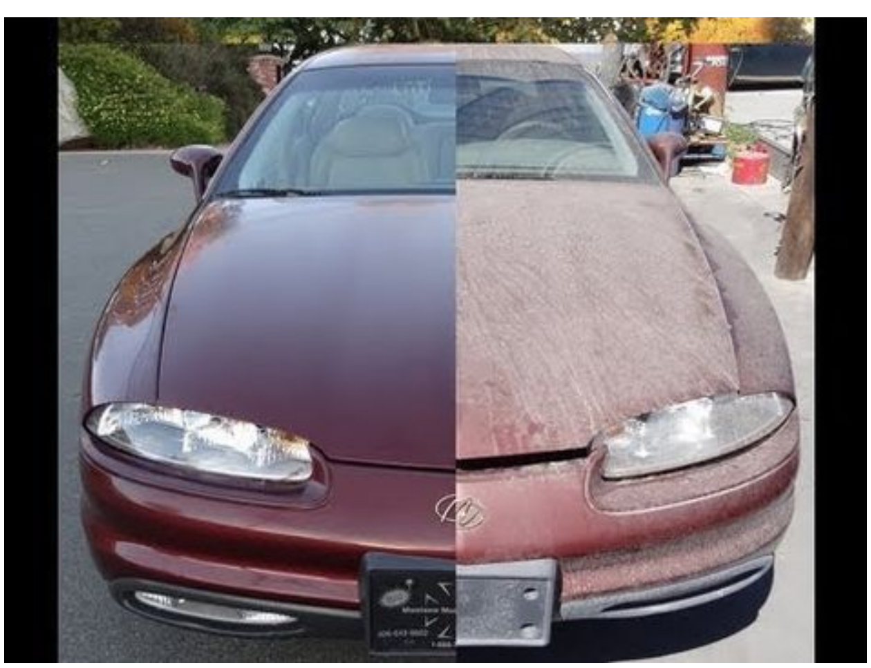
A buffer used with skill

That "and" connects it to some prerequisites that are required of us. Become skillful. Illustrate with a tool, that if skillfully used makes the task easier, but if used unskillfully might even cause harm. For example: a car buffer makes a car shine or destroys the paint. All depends on the skill of the user.