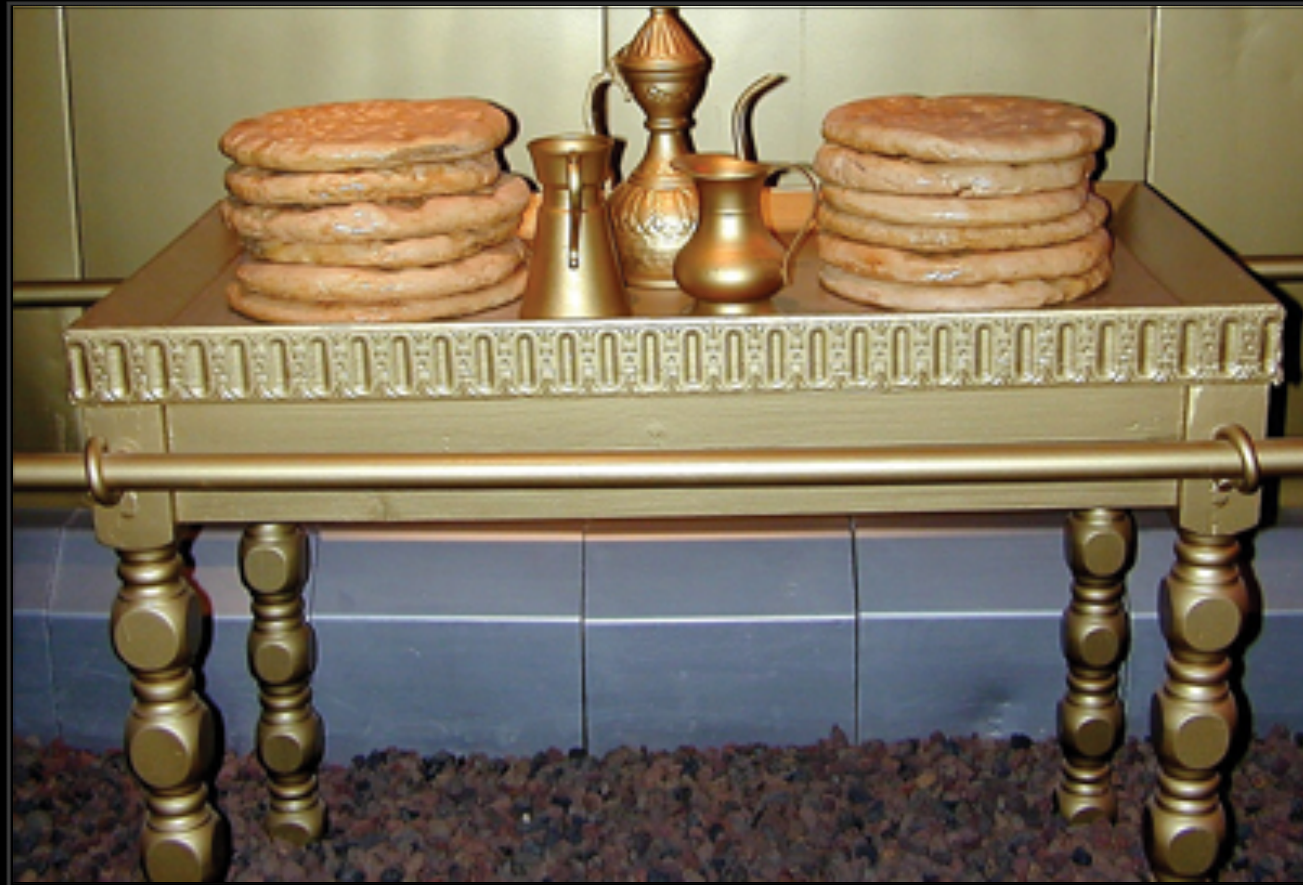
TABLE OF SHOWBREAD