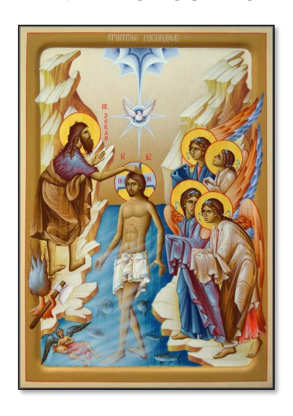
February 4, 2024