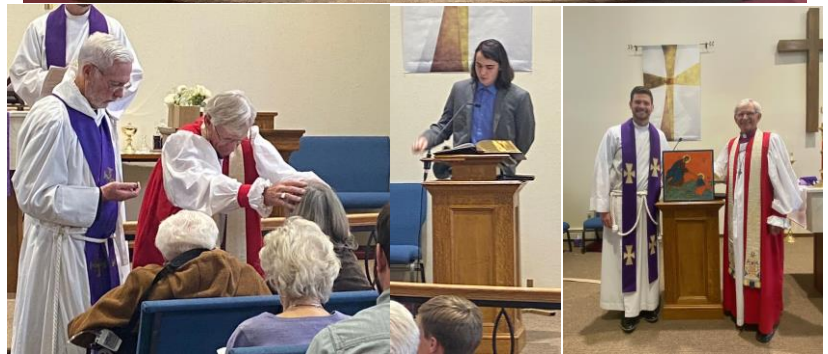
CONFIRMATION OF CLASS OF 2023 WITH THE LAYING ON OF HANDS BY BISHOP TREVOR WALTERS, TEEN TESTIMONIES AND PRESENTATION OF A NEW ICON.