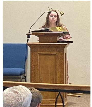
THE TEENS OF SAINT PETER'S PRESENT THEIR PERSONAL CONFIRMATION TESTIMONIES TO THE CONGREGATION.