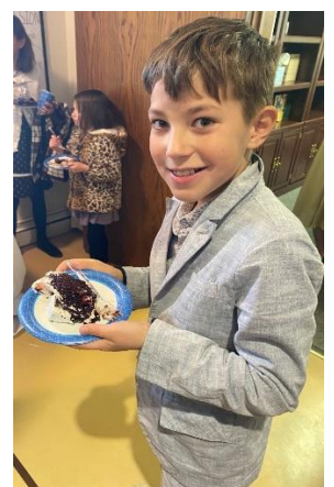
FOLLOWING THE CONFIRMATION SERVICE, A RECEPTION CONSISTING OF DELICIOUS DESSERTS WAS ENJOYED BY ALL!