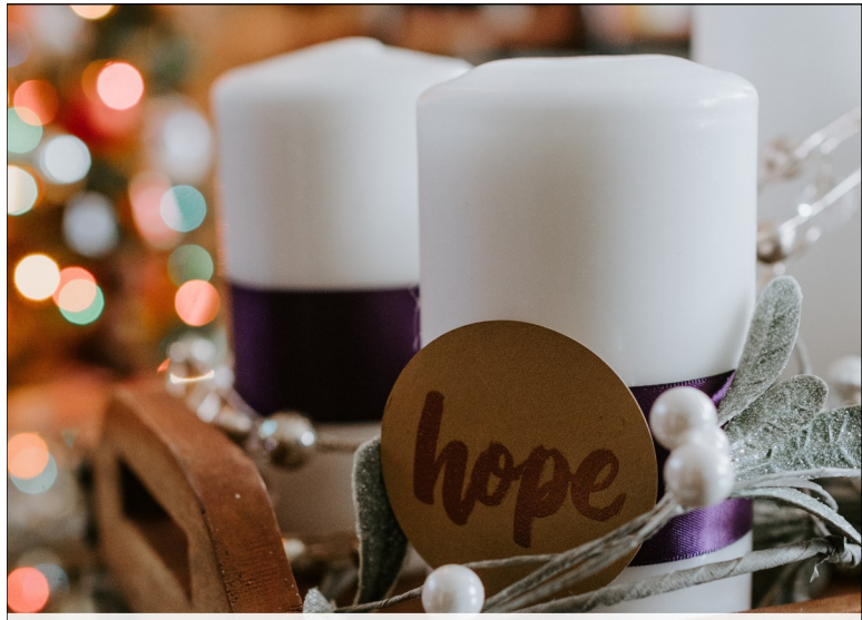
Luke 2:21-38 & I Tim. 3:16 "Who Are You Waiting For?"

We continue to pray for our housebound, those with chronic conditions that may require ongoing treatment, and those unspoken prayers.