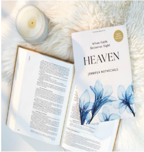
WHEN FAITH BECOMES SIGHT