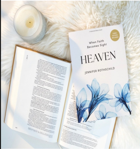
WHEN FAITH BECOMES SIGHT

WOW MINISTRY begins on Friday, August 29th 9 am - 11:00 am in the Fellowship Hall. This is a ministry for young moms and their children. Childcare from Nursery - 5th grade. Please sign up at the Welcome Desk .