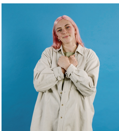
is the love of Christ.