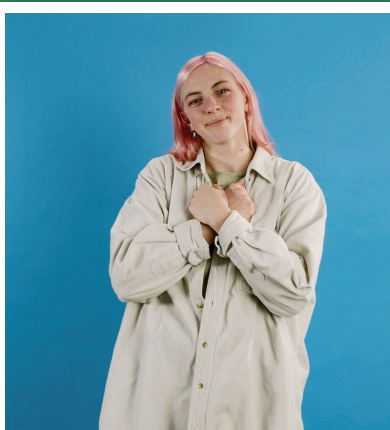
is the love of Christ.