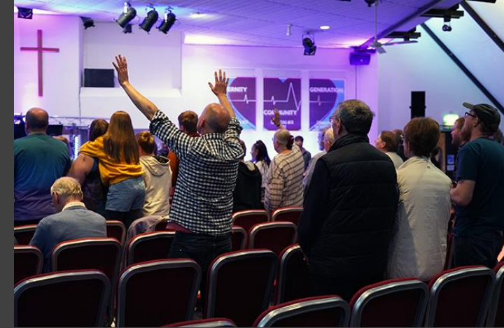
SMALL INNOVATIVE CHURCH